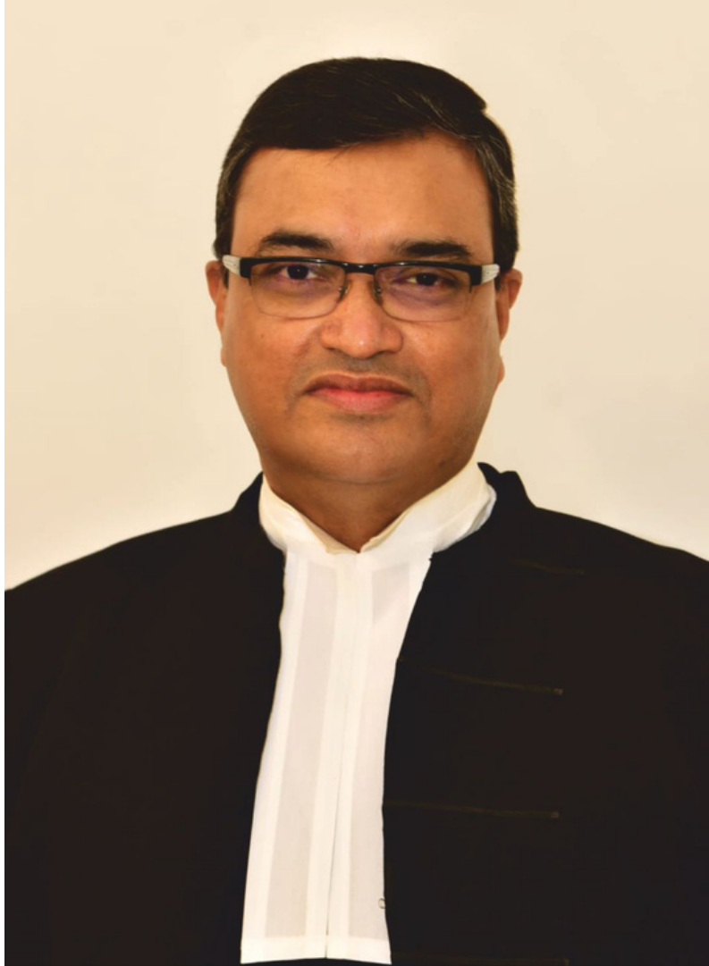
Justice Shri. Dipankar Datta Hon'ble Judge, High Court of Bombay Hon'ble Pro-Chancellor MNLU Mumbai